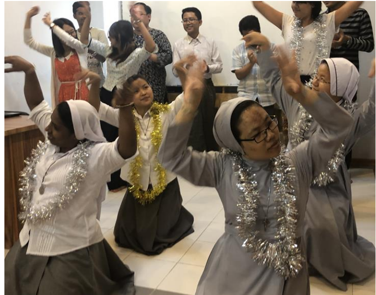
Leadership and Companionship