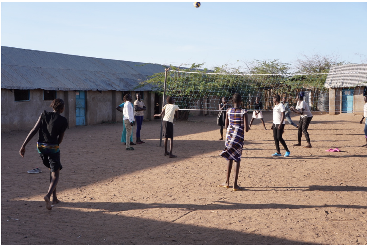
Figure 5: Girls' volleyball team, Kakuma, Kenya

Therefore, as graduates build their leadership skills, they become role models within their community, empowering youth to not only join sports initiatives but also encouraging them to pursue their studies and focus on their future. Coaching skills developed during the course are instrumental in solving issues faced by the community and addressing diverse needs. This impact on the community is not without consequences for graduates themselves, as this growth in existential competences boosted their self-confidence.