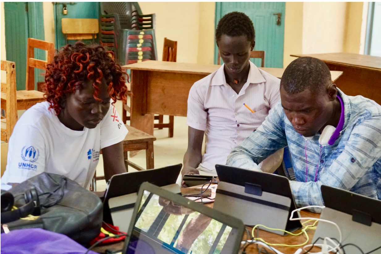
Figure 4: Youth Sports Facilitator onsite meeting, Kakuma, Kenya

graduates often apply their critical thinking and entrepreneurial skills, taking up advocacy roles and actively engaging with their communities to change customs with a view to promoting greater social inclusion and cohesion through sports.