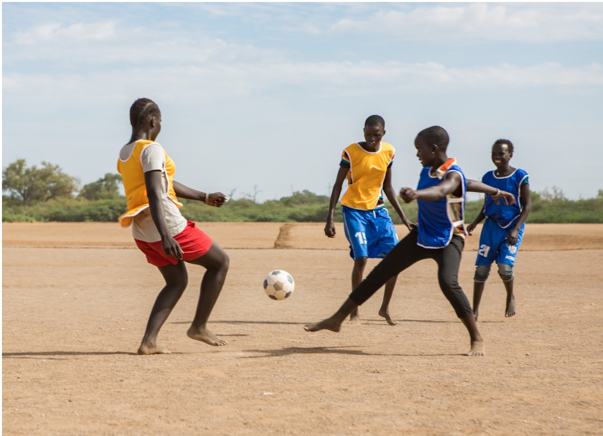
Figure 3: Youth playing football in Kakuma Camp, Kenya