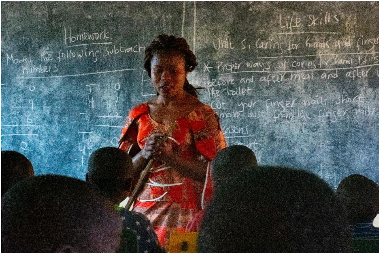
Figure 5: Learning Facilitator graduate teaching at a primary school in Malawi

The next section further discusses how the Learning Facilitator programme shapes graduates as servant leaders.