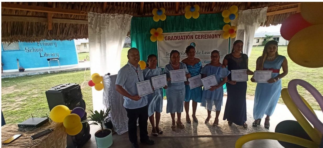
Figure 7: Learning Facilitator graduates at their graduation ceremony in St Ignatius, Guyana

In conclusion, the Learning Facilitator programme enabled graduates to experience personal empowerment not only through financial growth and skill-building, but also through education. As teachers, graduates transfer this empowerment to the whole community. Their dedication to volunteering, taking on leadership roles, and challenging cultural norms exemplifies their commitment to community development and transformation. Their willingness to collaborate and make a positive impact demonstrates how the programme equips graduates to become strong advocates for community development through education.