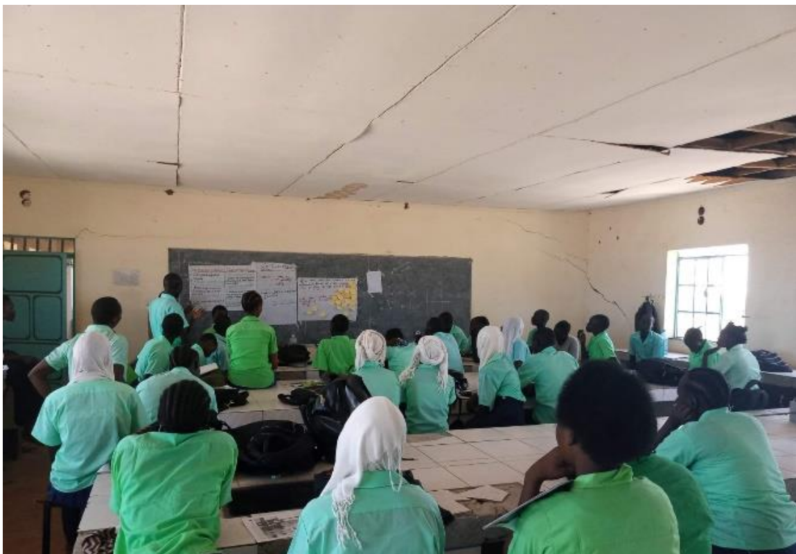
Figure 2: A Learning Facilitator graduate's classroom in Kakuma, Kenya

While graduates often engage in advocacy efforts to encourage female student access to education, they also serve as role models. In Afghanistan, this graduate highlighted their role as an example within the community, inspiring parents to send their daughters to school: