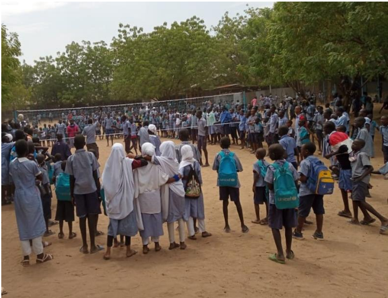
Figure 6: Volleyball game in a primary school in Kakuma, Kenya

Thus, graduates demonstrate a multifaceted approach to community engagement, viewing their roles as teachers as avenues to serve and collaborate with their communities, becoming effective transformative leaders. Their involvement encompasses various spheres of life, including family and community, as they actively take on leadership roles and contribute positively. This community engagement is not limited to community-building initiatives; graduates also act as advocates, engaging in constructive dialogues with relevant authorities to promote inclusive education and community development.