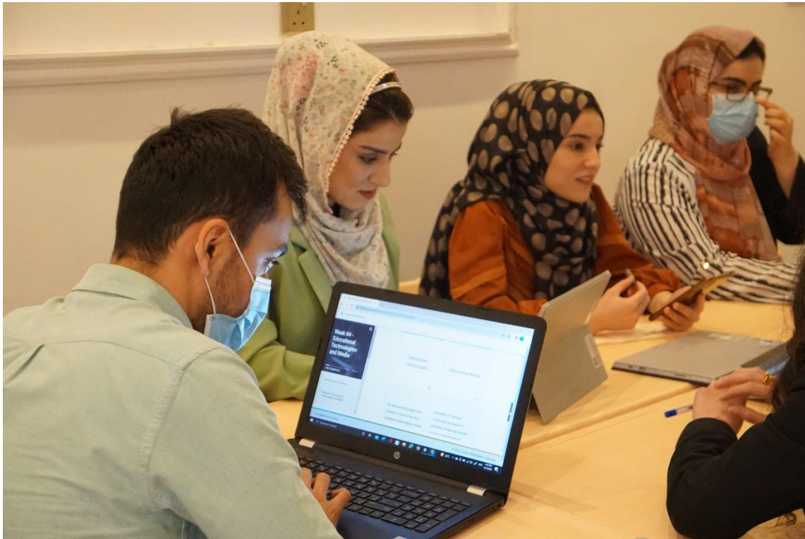
Figure 4: Learning Facilitator students in an onsite meeting in Erbil, Iraq

Other graduates cited building a code of conduct as part of fostering a supportive learning environment for their students. This graduate in Iraq explains how such tools are particularly helpful in their context as: