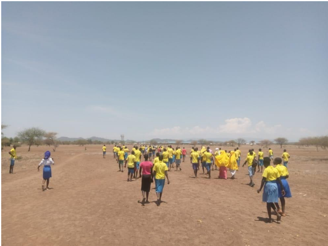
Figure 3: Learners on their way back from school in Kakuma, Kenya

As a result, when speaking with community members, their words are held as credible and often accepted without hesitation.